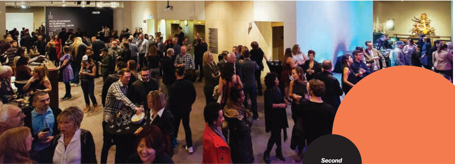
Second floor lobby