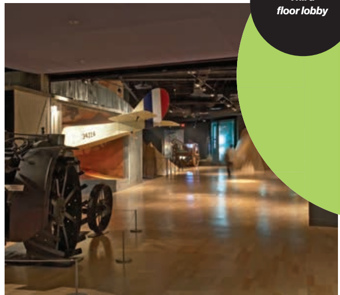
Third floor lobby

Treat your out of town guests to Glenbow's third floor, an unparalleled venue space to hold your next cocktail reception.