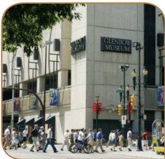
Glenbow Museum Sixth Floor, 130 9 Ave. S.E., Calgary

Glenbow Museum WHERE THE WORLD MEETS THE WEST