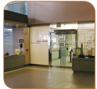
The City of Calgary Administration Building Main Floor, 313 7 Ave. S.E., Calgary