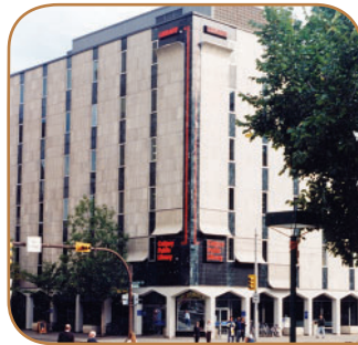
W.R. Castell Central Library Fourth Floor, Local History Room 616 Macleod Trail S.E., Calgary

Glenbow Museum WHERE THE WORLD MEETS THE WEST